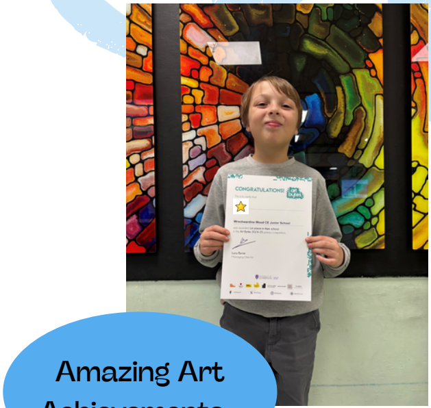
Amazing Art Achievements