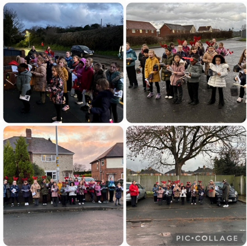
A Festive Finale for Our Christmas Craft and Carolling Club

The final meeting of our Christmas Craft and Carolling Club was truly special. After weeks of practice and preparation throughout the half term, the children took their festive cheer out into the local estate, singing the carols they had worked so hard to learn. Their voices filled the evening air with warmth and joy, creating a wonderful community atmosphere. Thanks to the generosity of local residents, the children raised over 40% of their target for the Severn Hospice through kind donations. In addition, one resident kindly gifted a tub of sweets for the children to share—a gesture that added an extra sprinkle of sweetness to the occasion. The weather was kind, making the evening even more enjoyable. Every child was a true credit to the school, demonstrating enthusiasm, kindness, and community spirit. It was a lovely way to celebrate the season and the hard work they've put in over the term.